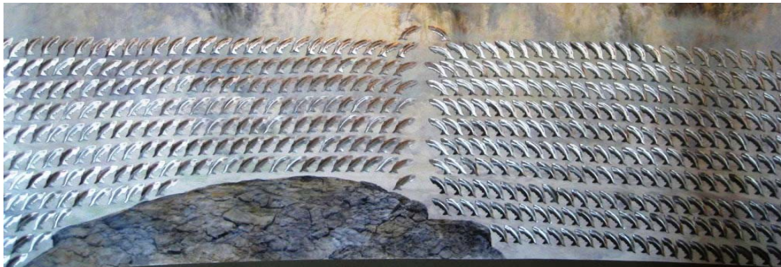
Donor board at the Tamástslíkt Cultural Institute, Pendleton, Oregon

For contributions valued at $XX (TBD by manager) or above, a donor board or wall located and integrated into the project office, visitor center, or other appropriate visitor facility may be used to recognize the donation.