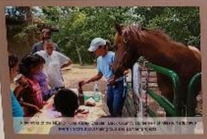
A view of the NEMO Club House, located on the shore of Mark Twain Lake.