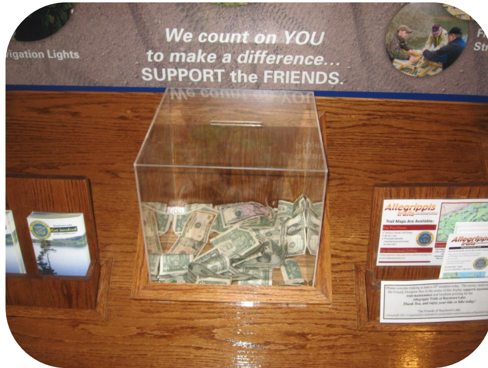
Raystown Visitor Center