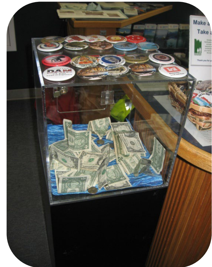
Bonneville Visitor Center