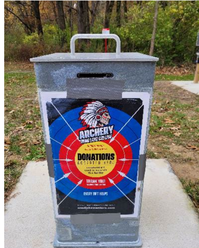
Mark Twain Lake FOREST Council and Rend Lake College Contribution boxes at recreation areas and visitor center