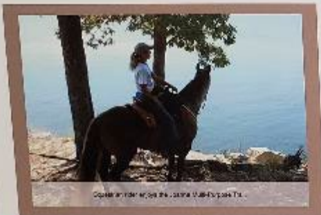
Come in for a ride on the Joanna Trail.

Each year, the U.S. Army Corps of Engineers partners with thousands of individuals and organizations on recreation and environmental projects to enhance our nation's natural resources. At Mark Twain Lake, we are proud of our broad range of partners and eagerly seek to expand mutually beneficial relationships with others.