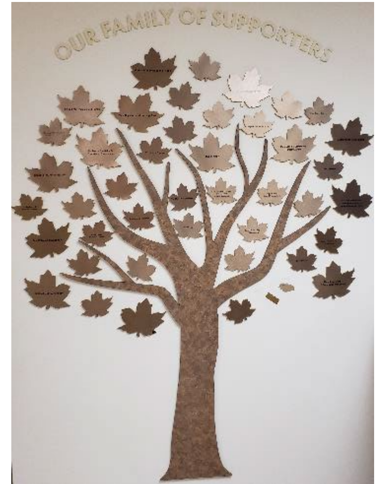
Donor tree at W Kerr Scott