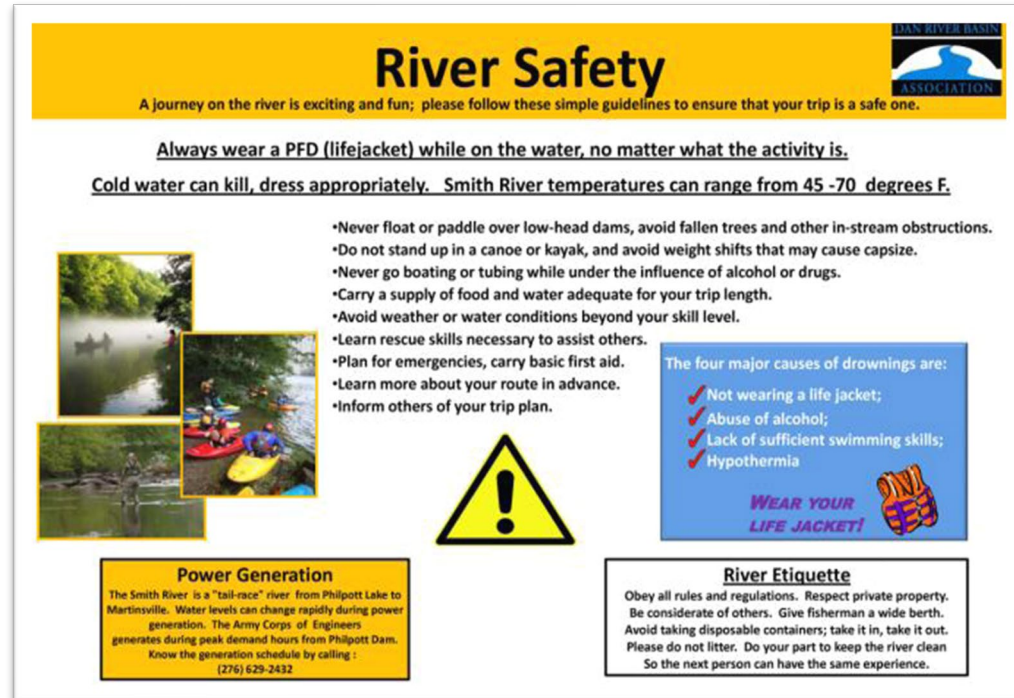
DRBA River Safety sign placed at launch sites along the Smith River