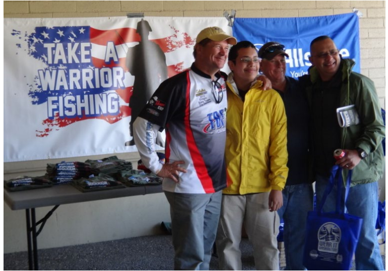
Multiple Lake sites are hosting events with support from the community, friends groups and corporations.