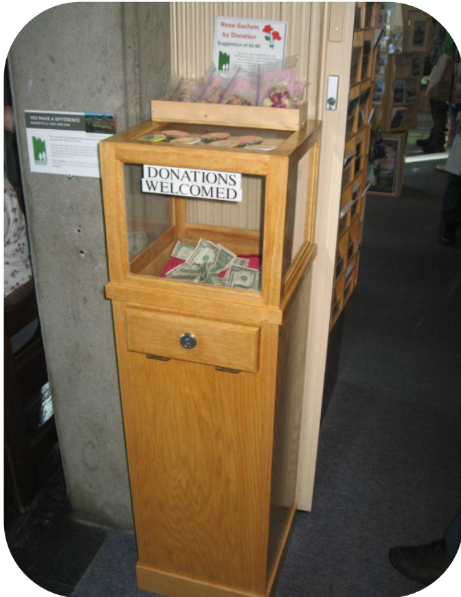
Bonneville Visitor Center