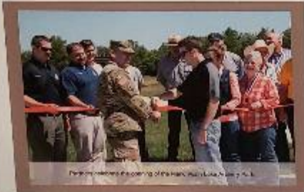
Part of the ribbon-cutting of the Mark Twain Lake.