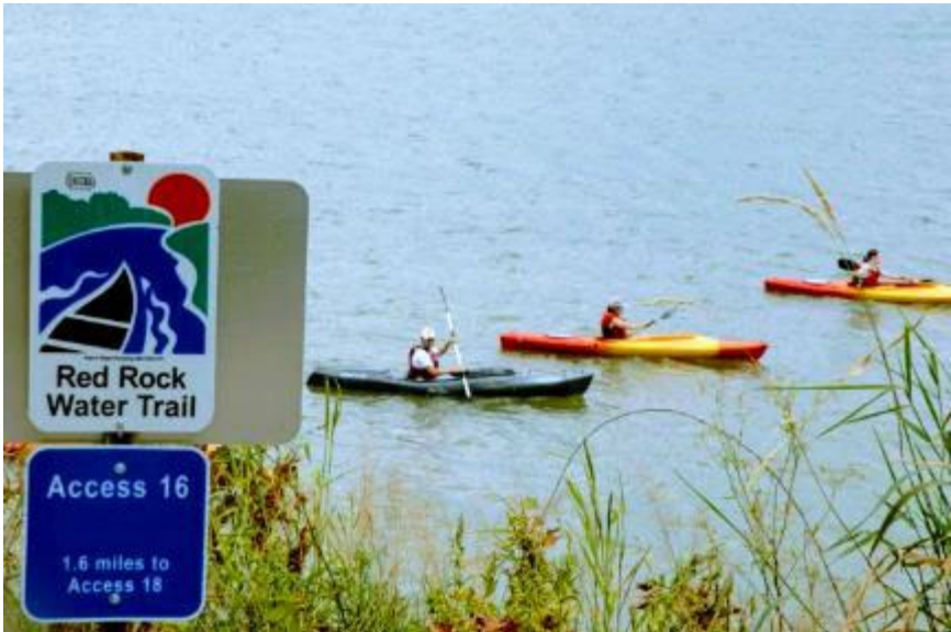
Lake Red Rock on the Des Moines River